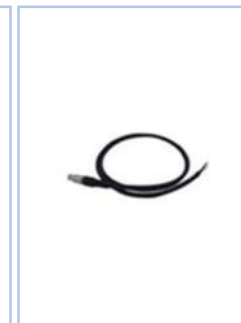
Serial Port Cable